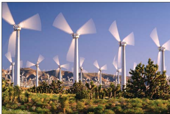
CO 2 free. To be a clean energy technology, hydrogen must be generated from wind, solar, or other carbon-free sources.

promoting energy efficiency, research on renewables, and development of hybrid cars, critics say. After all, many researchers point out, as long as hydrogen for fuel cell cars is provided from fossil fuels, much the same environmental benefits can be gained by adopting hybrid gasoline-electric and advanced diesel engines. As MIT chemist and former DOE director of energy research John Deutch and colleagues point out on page 974, hybrid electric vehicles—a technology already on the market—would im-